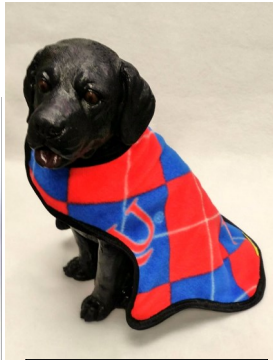
Doggy Jacket by Boomeroots