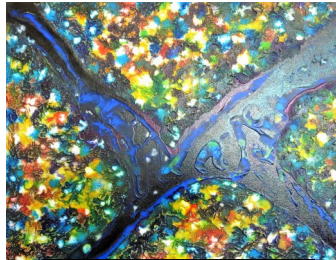
Dream Image by Randy Clark